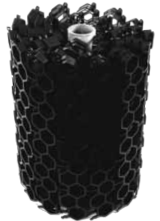
Tufftrack® Grassroad Pavers