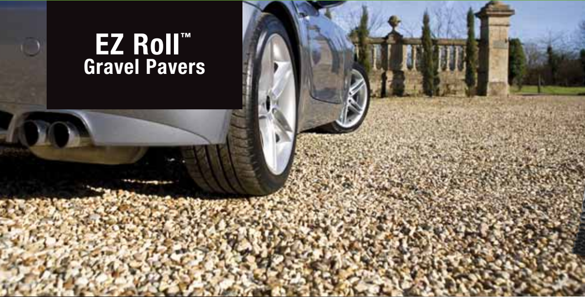
EZ Roll™ Gravel Pavers